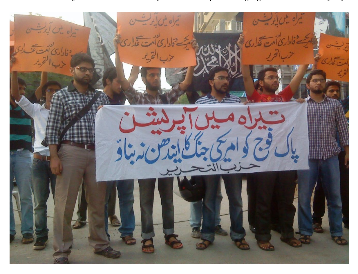
Karachi: Protestors demand that Pakistan's Army should not be used as fuel for the American War