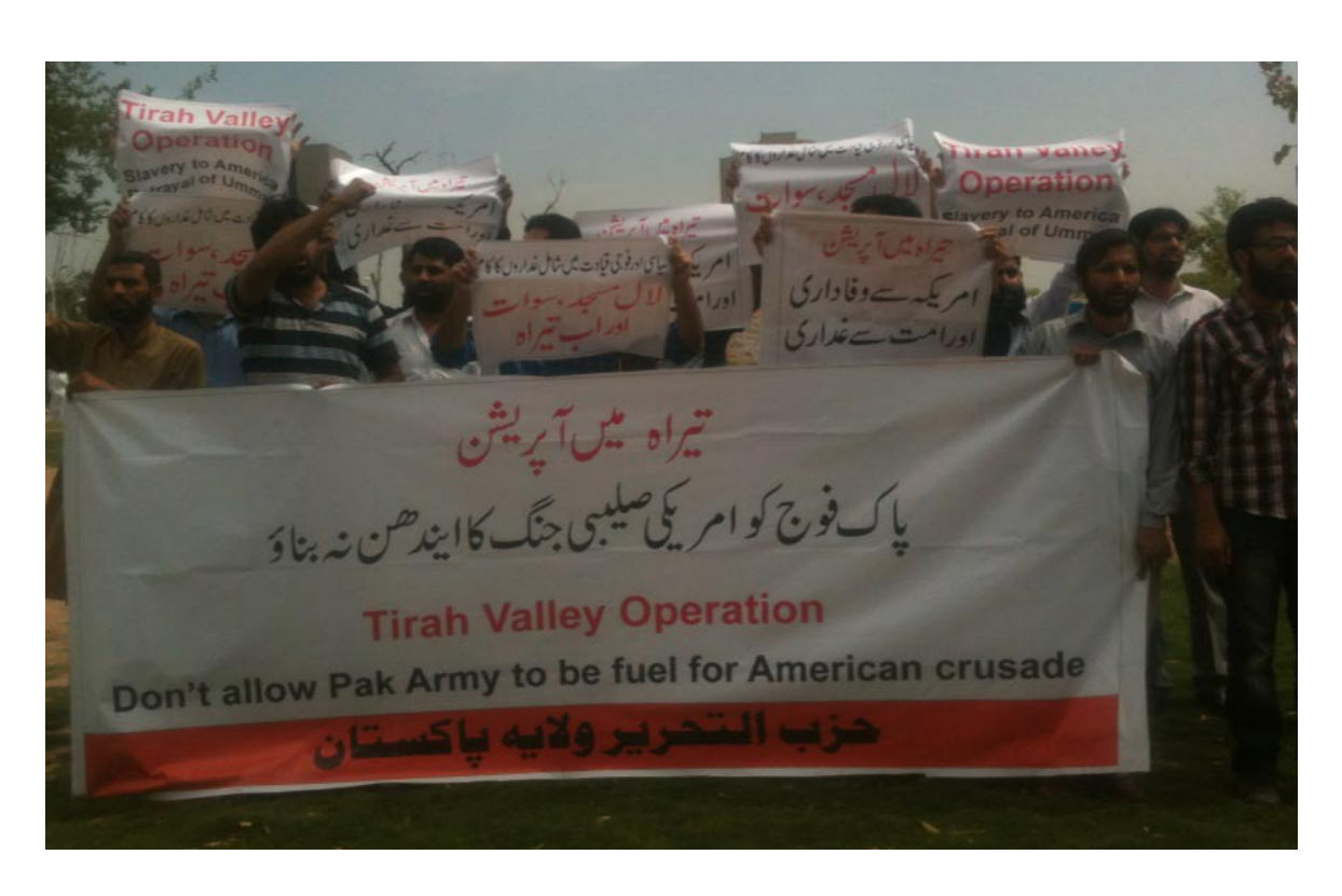
Islamabad: Members of Hizb ut-Tahrir Wilayah Pakistan protesting against Tirah Valley Operation