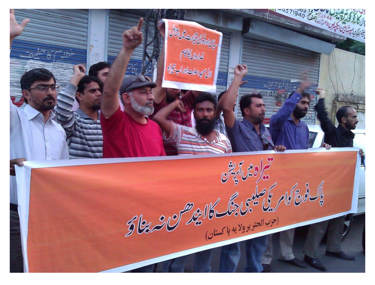
Lahore: Protestors chant slogans against the civilian and military leadership for their treachery