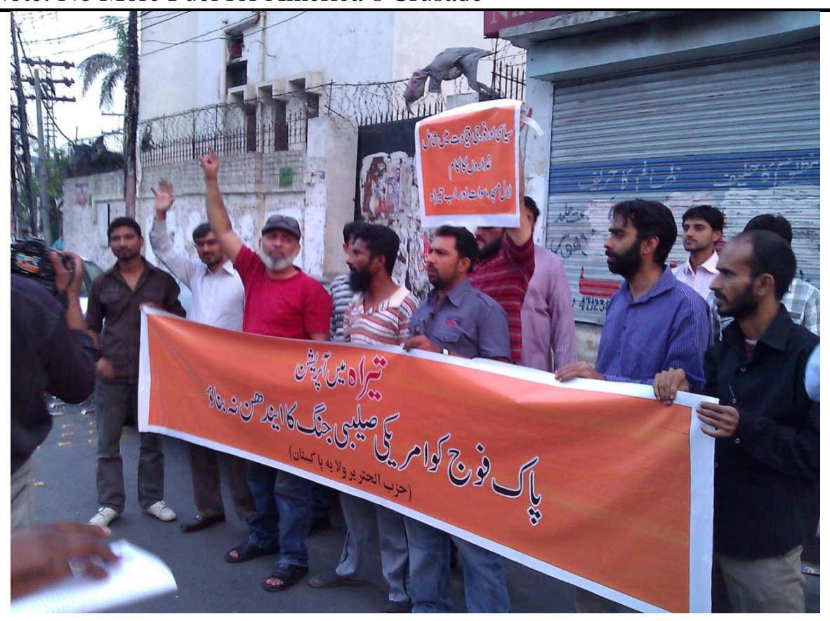
Lahore: Members of Hizb ut-Tahrir display banners and placards against Tirah Valley Operation